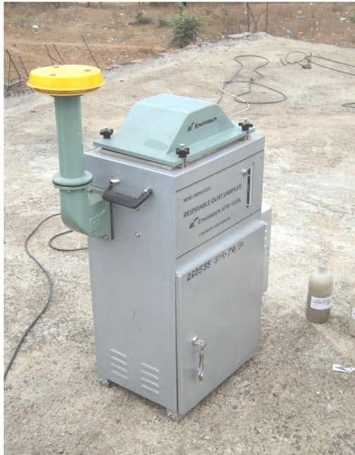
RDS "Envirotech Model APM 460 BL & APM 411